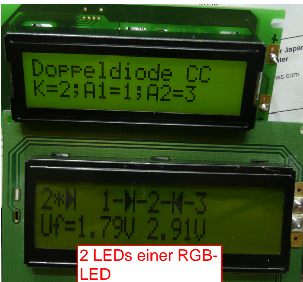
2 LEDs einer RGB-LED